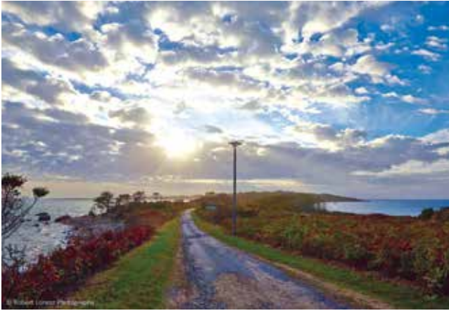
PLUM ISLAND EXHIBIT