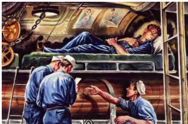
RIGHT: "NEWS FROM HOME" BY GEORGES SCHREIBER FROM THE NAVY ART COLLECTION.