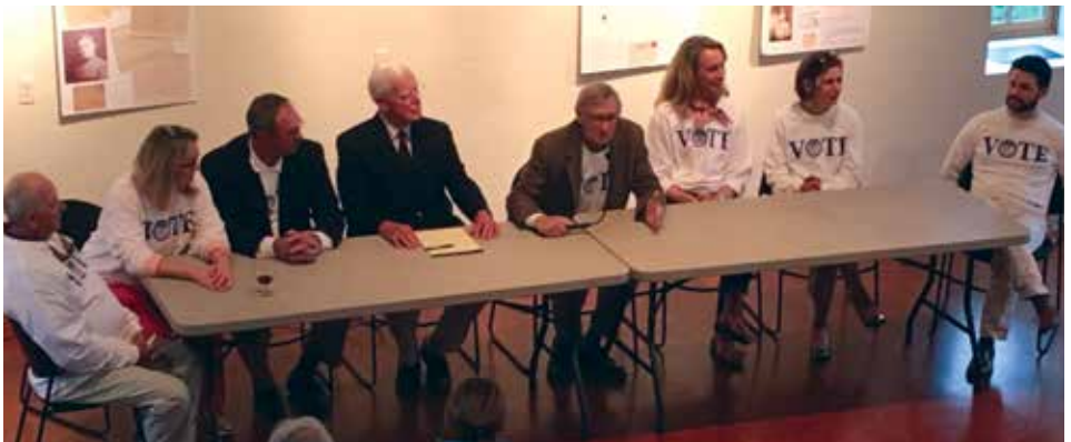
STONINGTON BOROUGH CANDIDATES FORUM