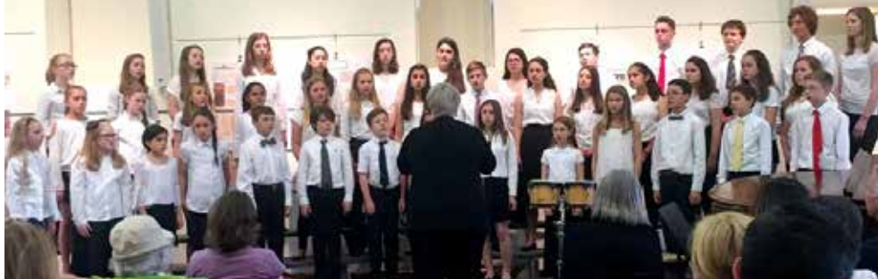
MYSTIC MIDDLE SCHOOL CHORUS