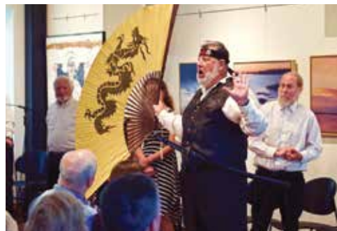
CONNECTICUT GILBERT & SULLIVAN SOCIETY

We're always grateful for the talented group of seasoned local artists who shared their expertise with young budding artists in our 8th Annual Youth Summer Art and Holiday Art Workshops , and we again presented the annual Celebrating Art in Autism exhibit in April.