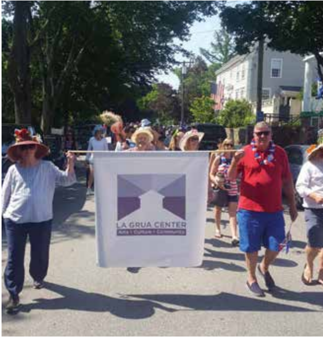
BOROUGH 4TH OF JULY PARADE