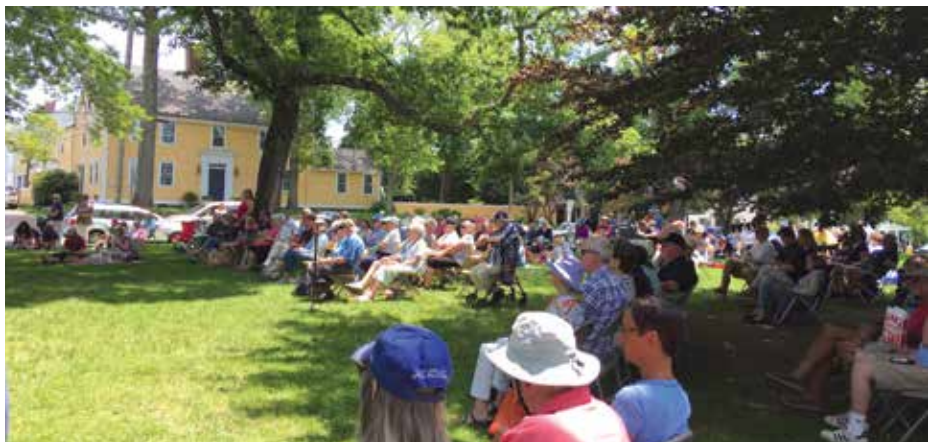
STONINGTON SOUNDS AT WADAWANUCK SQUARE