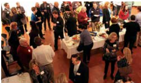
BUSINESS AFTER HOURS