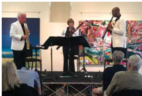
PREVAILING WINDS TRIO