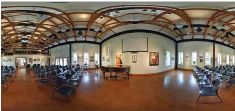
A 360° VIEW