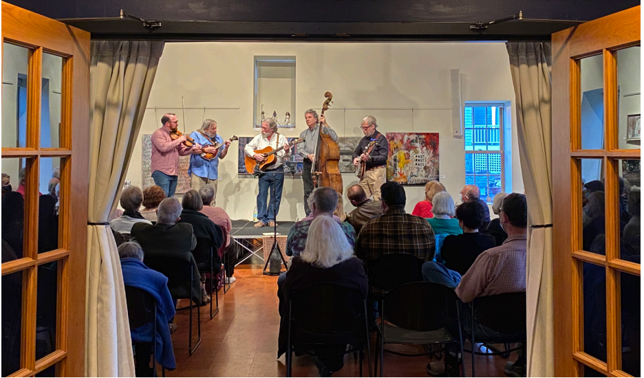
HOPE VALLEY VOLUNTEERS PERFORMING AT A MUSIC MATTERS CONCERT WITH PARTIAL VIEW OF LOBBY REDESIGN BY LOCAL ARCHITECT JULIA LEEMING.

ENGAGING COMMUNITY THROUGH ARTS AND CULTURE