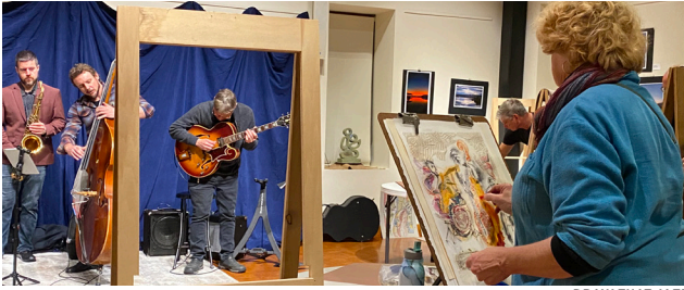
DRAW THAT JAZZ