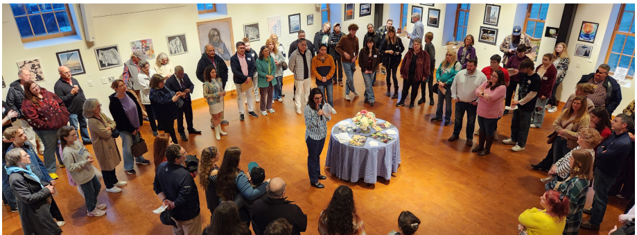
EMERGING ARTISTS EXHIBIT OPENING

The Board of Directors consists of passionate individuals who are involved in supporting our programs, mission, and future. We are proud to have a 100% giving board, with each board member donating to our programs and events every year.