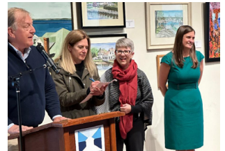
STONINGTON CULTURAL DISTRICT CELEBRATION