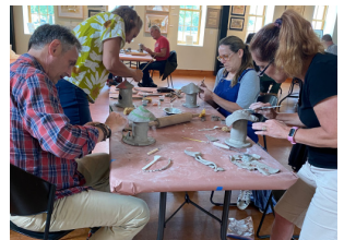
ADULT ART WORKSHOP