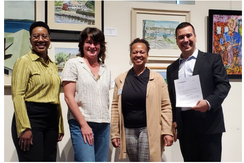
MEMBERS OF THE BOARD AND STAFF WITH SPONSOR: EVERSOURCE ENERGY

grants from the Dominion Energy Charitable Foundation and the George & Grace Long Foundation in support of our Music Matters concerts; a sponsorship from SVIA for our free outdoor concerts and a sponsorship from the Chelsea Groton Foundation for our affordable family concerts. Our Summer Soirée sponsors, whose generous support makes our year-long programs possible, included Cove Ledge Beer, Wine and Spirits, UBS, Dime Bank, Dog Watch Catering, Eversource Energy, Waller Smith & Palmer, Beer'd Brewing Co., Charter Oak Federal Credit Union, Chelsea Groton Bank, Grover Insurance/Ferguson & McGuire, Pappas MacDonnell, Inc., Robinson+Cole, Spencer & Lynn Wine and Spirit Merchants, Stonington Garden Club, Suisman Shapiro, The Real McCoy Rum, and Veritable Distillery.