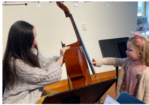
MOZART FOR MUNCHKINS