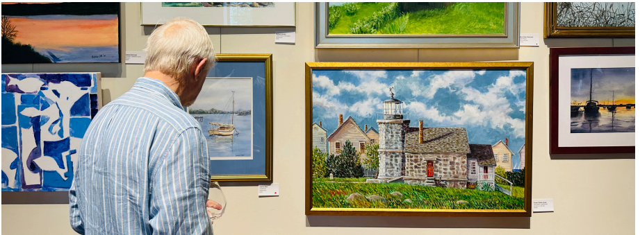
STONINGTON ARTIST EXHIBIT

The Board of Directors is made up of passionate leaders who advance our mission, sustain our programs, and steward our future. We are proud to have 100% Board giving, with every director making an annual gift.