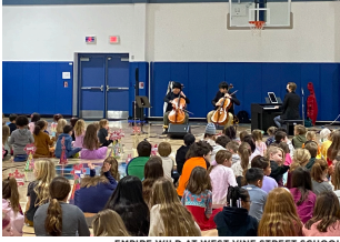
EMPIRE WILD AT WEST VINE STREET SCHOOL