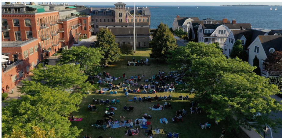
CONCERT ON THE GREEN