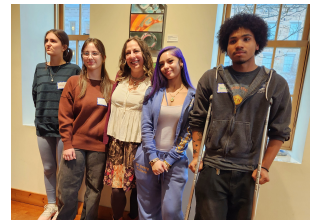
EMERGING ARTISTS FROM GRASSO TECH

In the gallery we showcased community and regional talent across six exhibitions: the 15 th Annual Stonington Artists exhibit with works from artists in Stonington , Mystic , and Pawcatuck ; Coming Out for Art with OutCT ; The Art of Belonging which featured artwork by artists supported by Vista Life Innovations , a nonprofit organization that helps individuals with disabilities; Art & Gardens showcasing a captivating collection of works by the talented members and friends of the Stonington Garden Club ; the